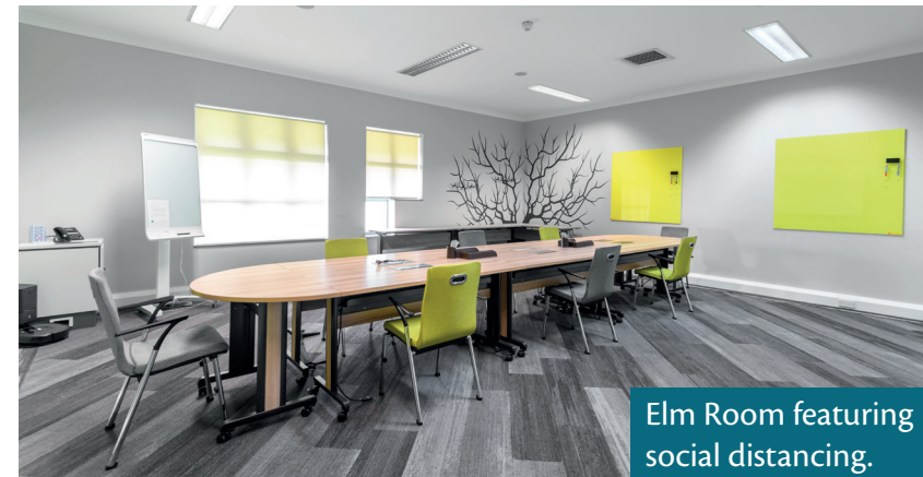
Elm Room featuring social distancing.