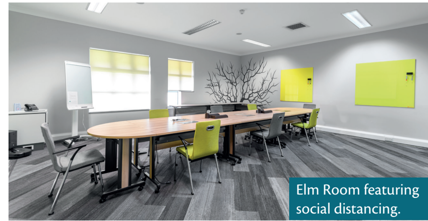
Elm Room featuring social distancing.